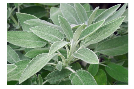
Figure 1. Whole plant of Salvia officinalis

Salvia officinalis L., an aromatic and medicinal plant, is widely recognized for its pharmacological properties [1]. S. officinalis is a woody-stemmed, evergreen subshrub [2] with blue to purplish flowers and whitish leaves (Figure 1). Other common names for this plant include common sage, garden sage, and garden sage [3]. A member of the Lamiaceae family, S. officinalis is native to the Mediterranean region but has naturalized in various parts of the world [4]. It has a long history of being used as an ornamental garden plant, in culinary applications, and in traditional medicine. Numerous unrelated species are also known by the common name "sage." The use of S. officinalis has been associated with improved fertility [5, 6]. Historically, S. officinalis has been utilized as a styptic, a local anesthetic for the skin, and a diuretic [7]. Today, it has become naturalized in many regions, particularly in North America and Europe [8, 9]. The aerial parts of the S. officinalis shrub have a long history of use in traditional medicine and cooking [10]. Due to its ability to impart flavor and spice, this plant is frequently used in the preparation of various dishes.